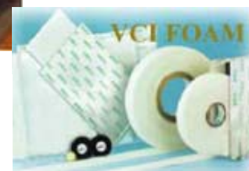
VCI adhesive backed foams in easy to use tape construction