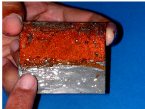
Treated With Vapro 811G